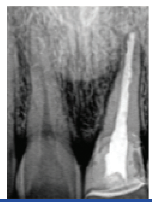
[Table/Fig-11]: One year follow-up radiograph of 21 without any radiolucency in the periapical tissues.

Talon cusps occur usually on the lingual or palatal surfaces of the anterior teeth. Talon cusps may be associated with Mohr syndrome,