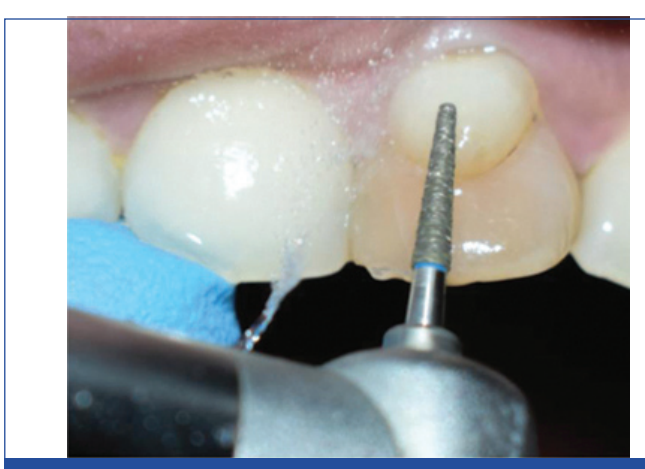
[Table/Fig-6]: Reduction of talons cusp with TR-13 bur

cervical and proximal areas. Preparation was extended onto proximal surfaces just labial to or slightly into contact areas). A 0.5 mm deep chamfer finish line was given with the round end tapered diamond held parallel to the lingual surface. Finished facial preparation in 2 planes. Incisal edge was reduced 1.5 mm to provide porcelain coverage [Table/Fig-7]. Impression was taken with the putty (Aquasil, Dentsply) and light body impression material (Express XT light body, 3M ESPE) with single step impression technique.