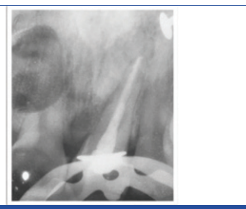
[Table/Fig-5]: Postoperative radiograph of 21 with radiopaque filling.

Extra cusp like protuberance was reduced with TR-13 (tapered round bur) (Mani) [Table/Fig-6]. Tooth was prepared in single sitting by reducing 0.75 mm enamel with a tapered round fissure bur (TR 13, Mani) creating a light chamfer without internal line angles in