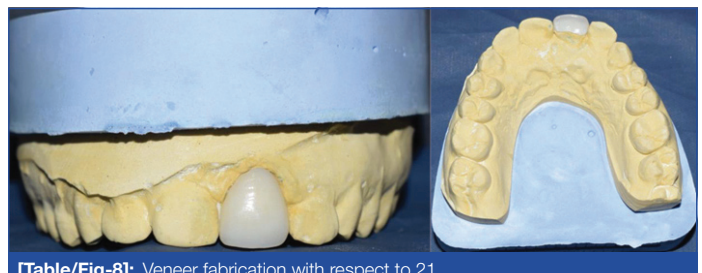
[Table/Fig-8]: Veneer fabrication with respect to 21

Shade selection was done using Vita Classical Shade Guide (Vident, Brea, CA, USA). Shade tab was kept next to the tooth; A1 shade was selected. Gingival retraction cord 000 (Prime dental, India) was placed into the gingival sulcus for 5-8 minutes to slightly displace the tissue. Veneer was fabricated in relation to 21 and before placing on the tooth, veneer trial was done on cast [Table/Fig-8].